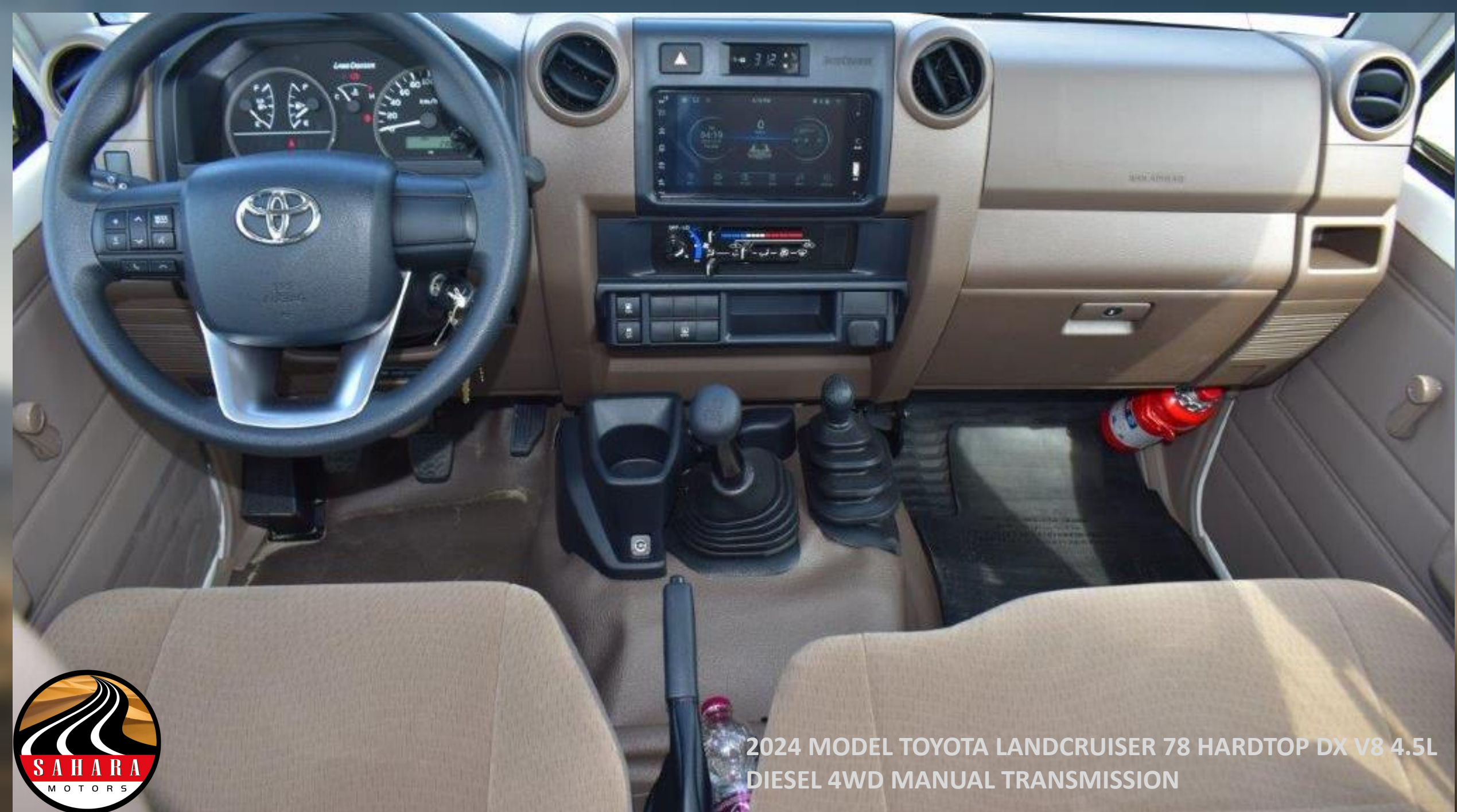
2024 MODEL TOYOTA LANDCRUISER 78 HARDTOP DX V8 4.5L DIESEL 4WD MANUAL TRANSMISSION