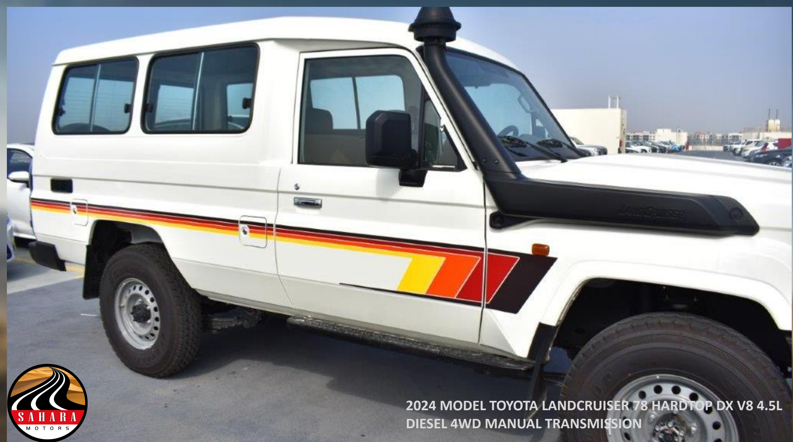
2024 MODEL TOYOTA LANDCRUISER 78 HARDTOP DX V8 4.5L DIESEL 4WD MANUAL TRANSMISSION