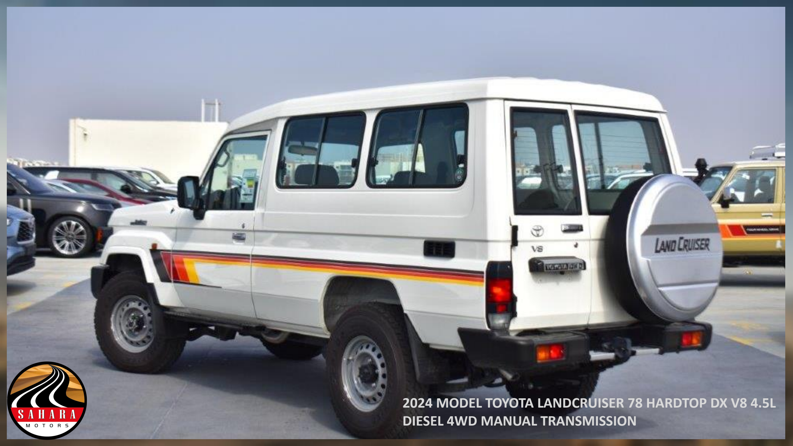
2024 MODEL TOYOTA LANDCRUISER 78 HARDTOP DX V8 4.5L DIESEL 4WD MANUAL TRANSMISSION