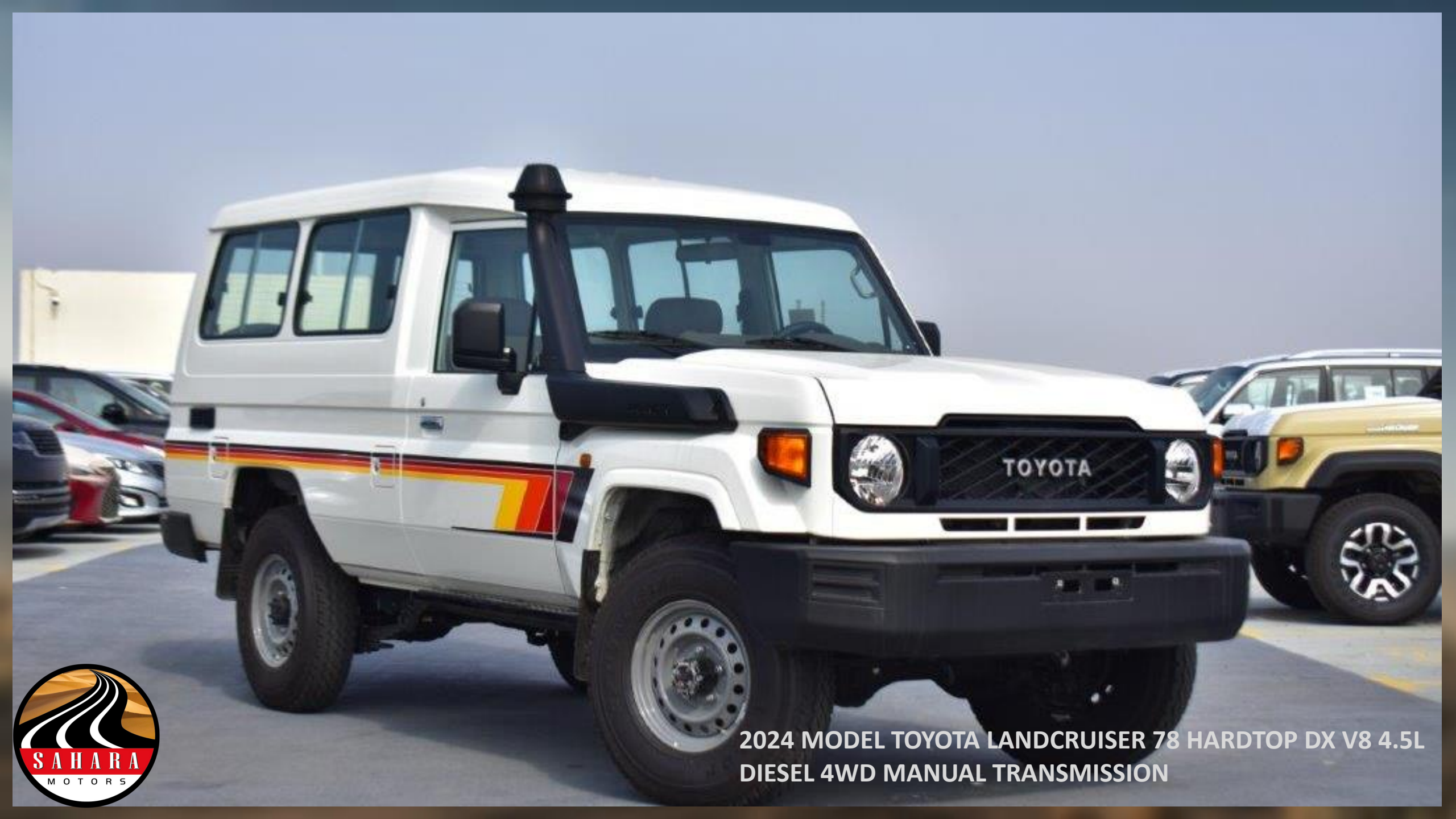
2024 MODEL TOYOTA LANDCRUISER 78 HARDTOP DX V8 4.5L DIESEL 4WD MANUAL TRANSMISSION