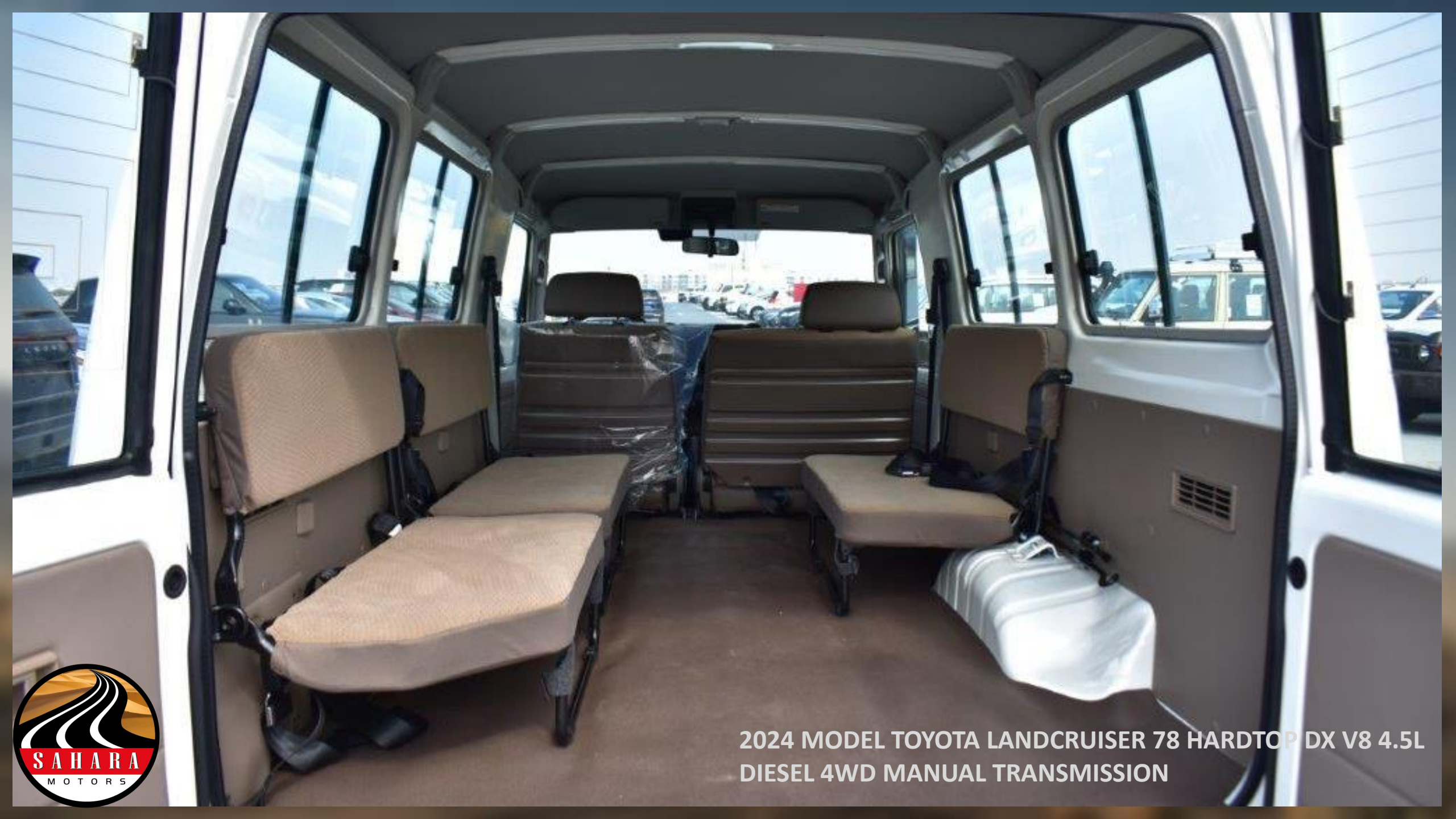
2024 MODEL TOYOTA LANDCRUISER 78 HARDTOP DX V8 4.5L DIESEL 4WD MANUAL TRANSMISSION