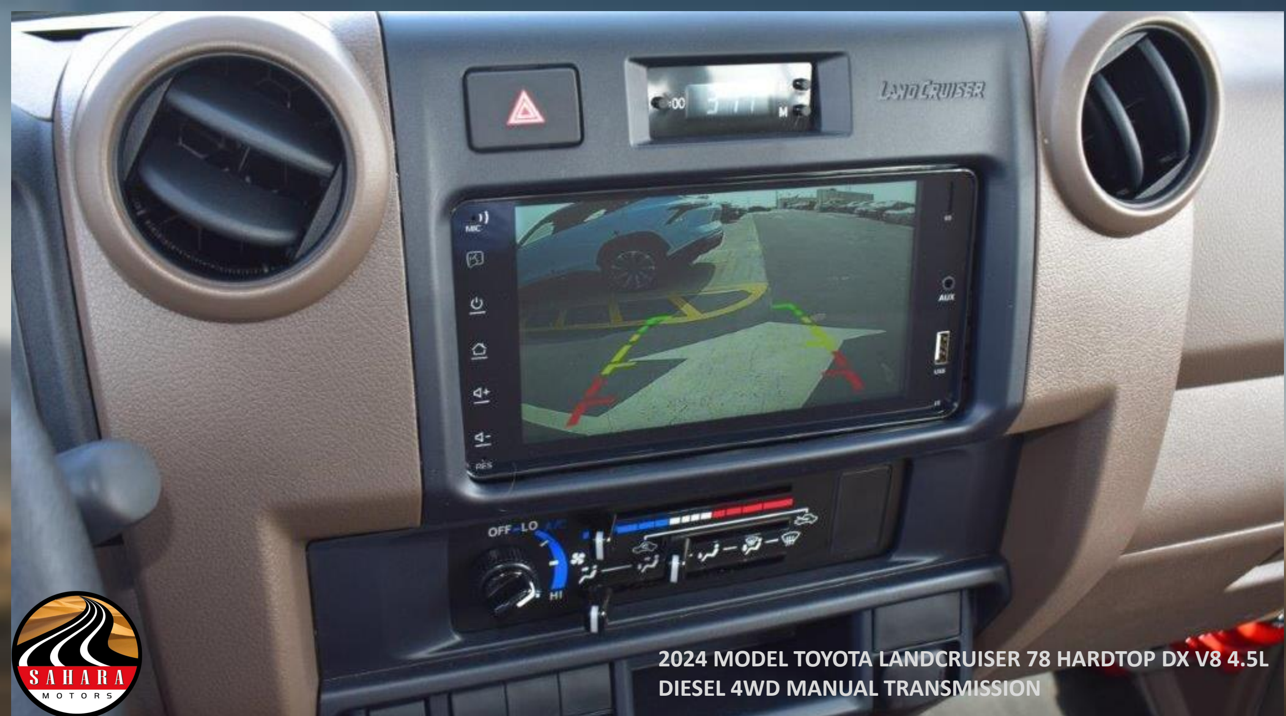
2024 MODEL TOYOTA LANDCRUISER 78 HARDTOP DX V8 4.5L DIESEL 4WD MANUAL TRANSMISSION