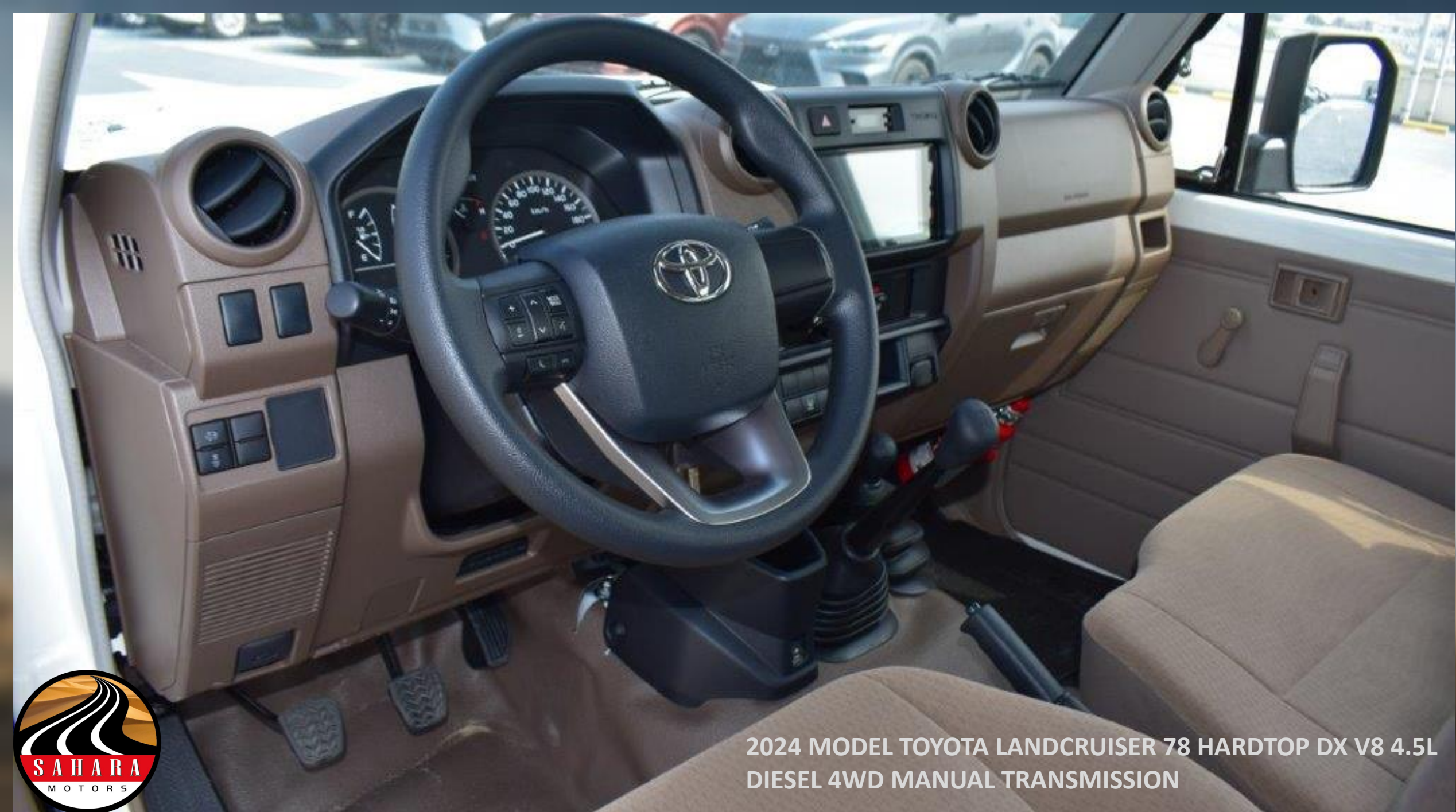
2024 MODEL TOYOTA LANDCRUISER 78 HARDTOP DX V8 4.5L DIESEL 4WD MANUAL TRANSMISSION