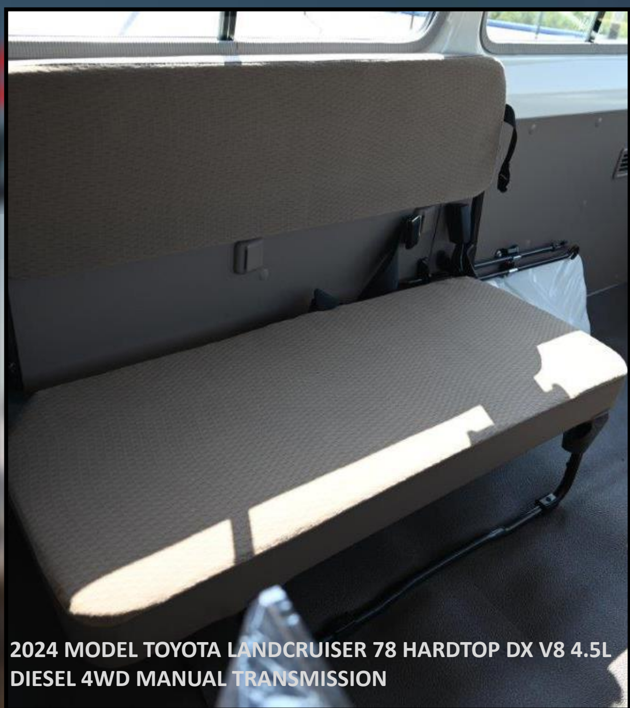
2024 MODEL TOYOTA LANDCRUISER 78 HARDTOP DX V8 4.5L DIESEL 4WD MANUAL TRANSMISSION