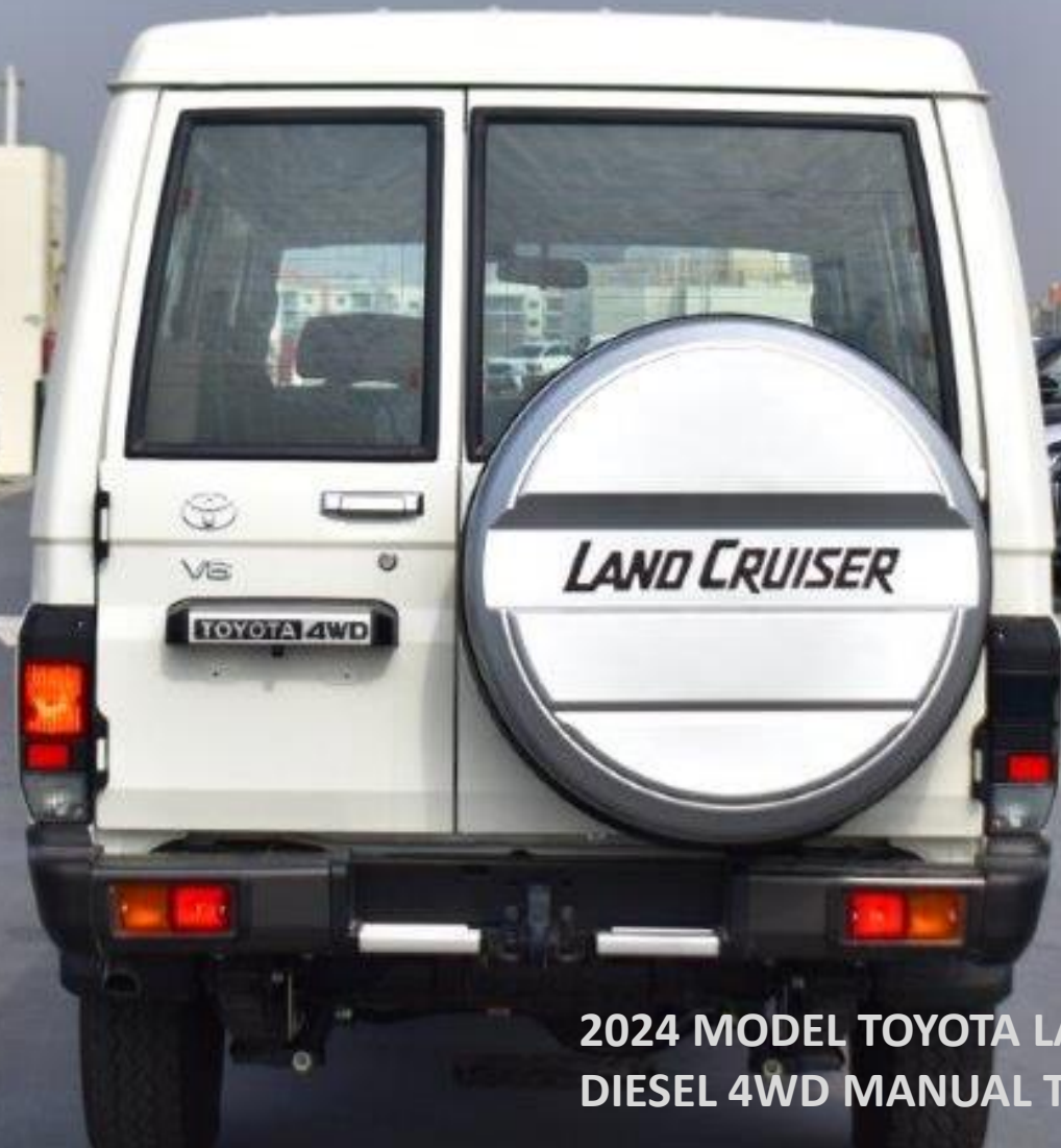
2024 MODEL TOYOTA LANDCRUISER 78 HARDTOP DX V8 4.5L DIESEL 4WD MANUAL TRANSMISSION