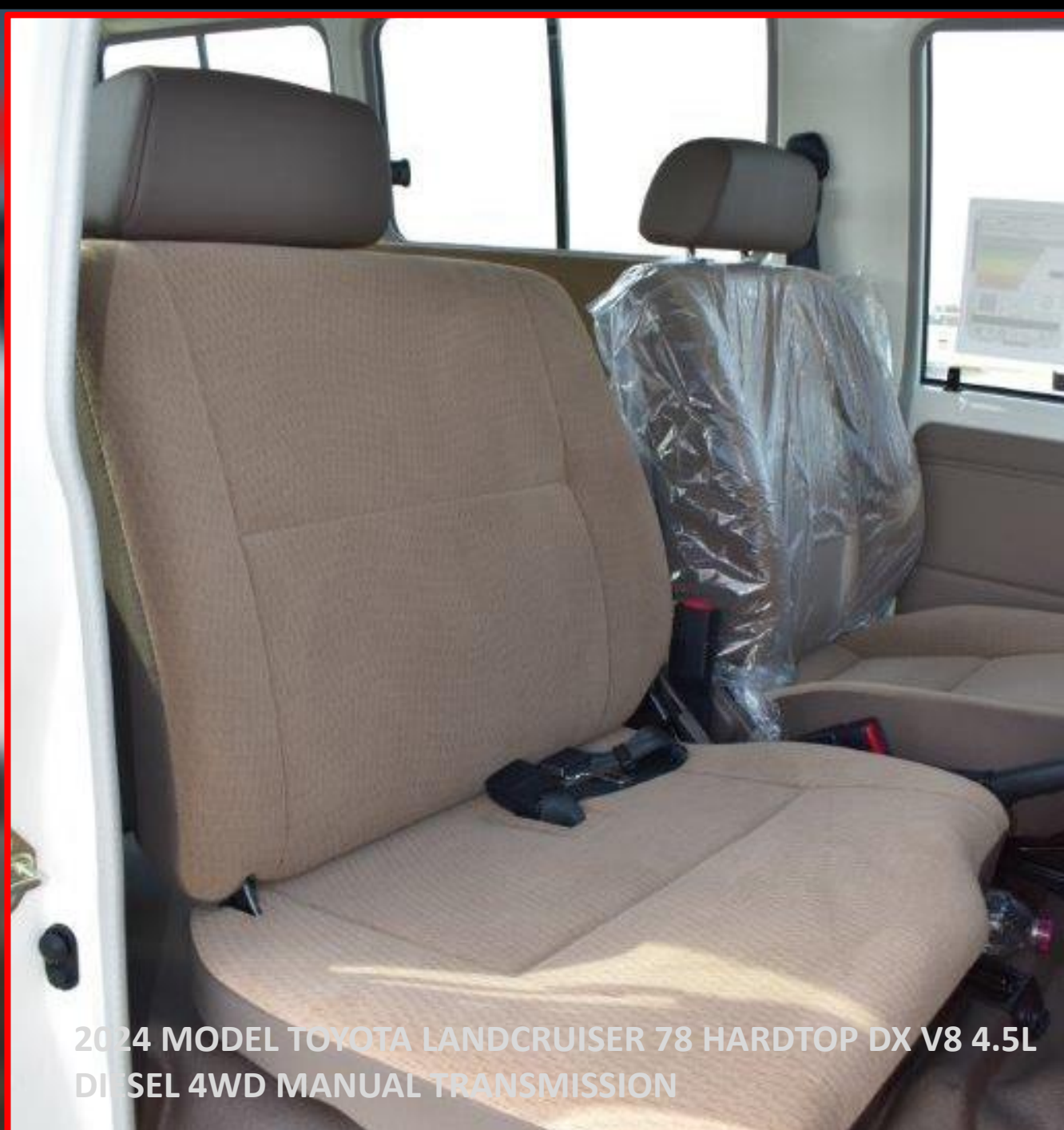
2024 MODEL TOYOTA LANDCRUISER 78 HARDTOP DX V8 4.5L DIESEL 4WD MANUAL TRANSMISSION