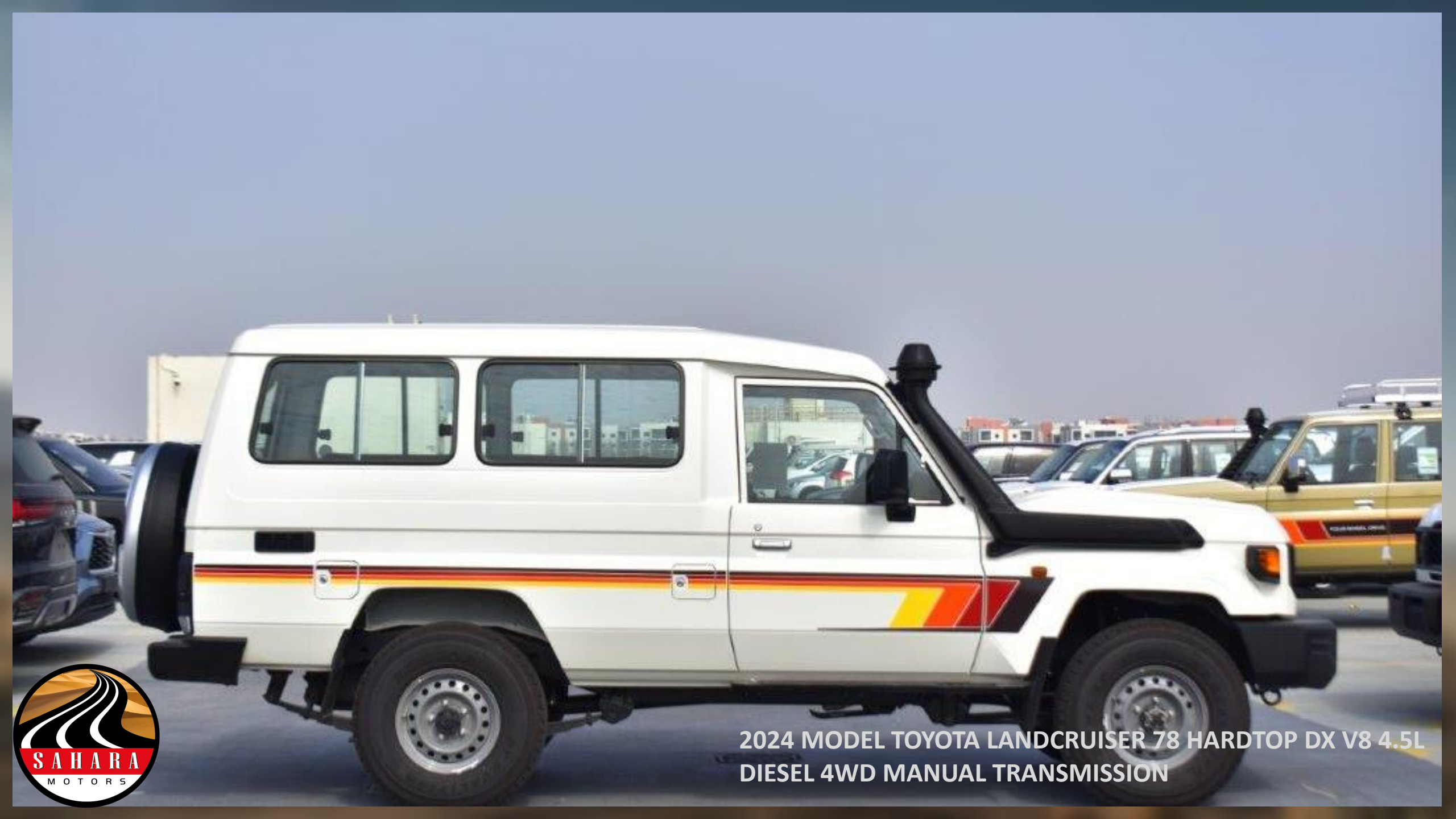
2024 MODEL TOYOTA LANDCRUISER 78 HARDTOP DX V8 4.5L DIESEL 4WD MANUAL TRANSMISSION