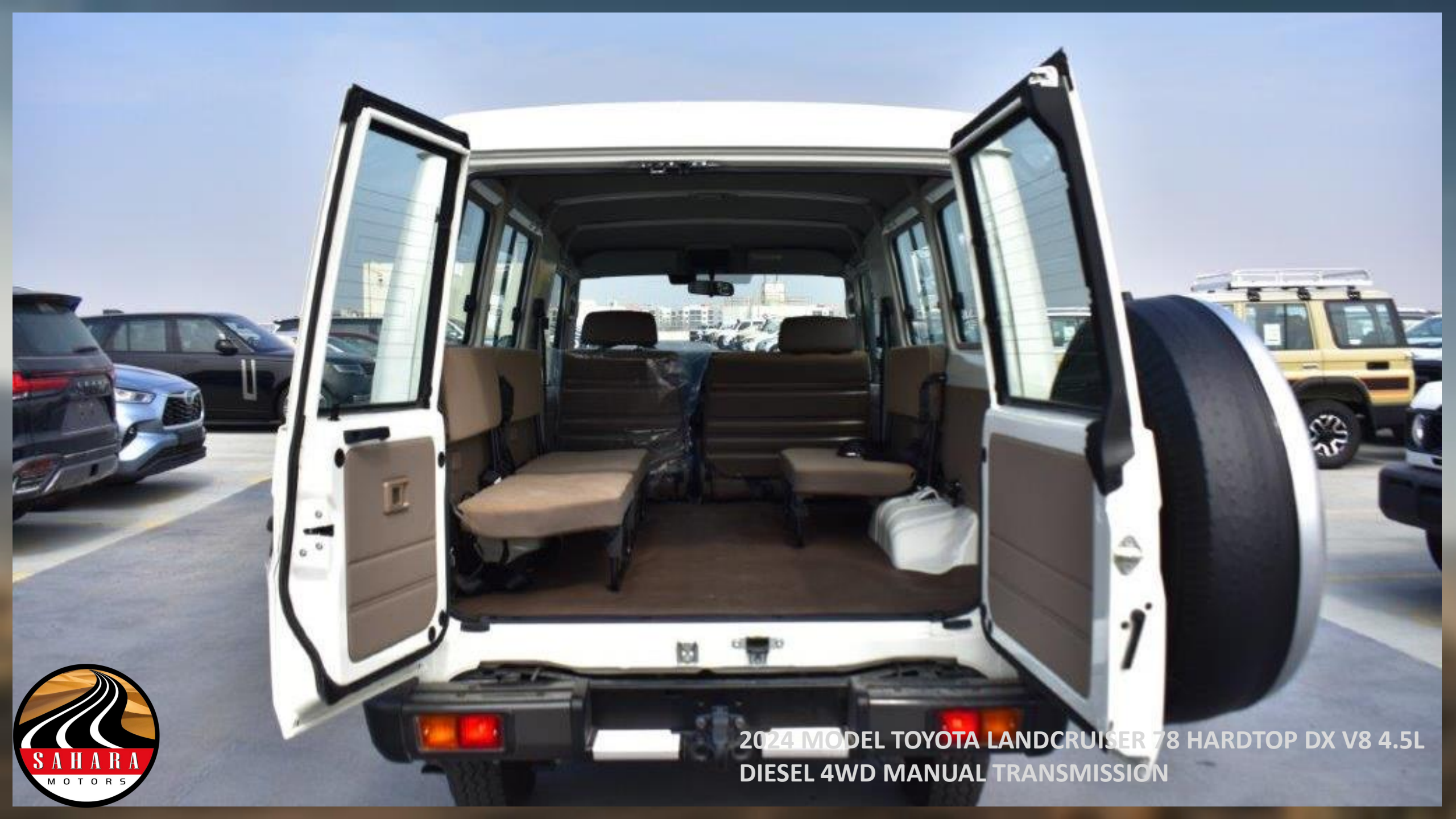
2024 MODEL TOYOTA LANDCRUISER 78 HARDTOP DX V8 4.5L DIESEL 4WD MANUAL TRANSMISSION