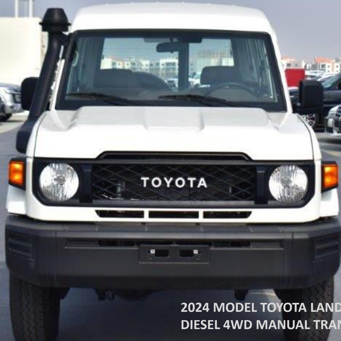
2024 MODEL TOYOTA LANDCRUISER 78 HARDTOP DX V8 4.5L DIESEL 4WD MANUAL TRANSMISSION