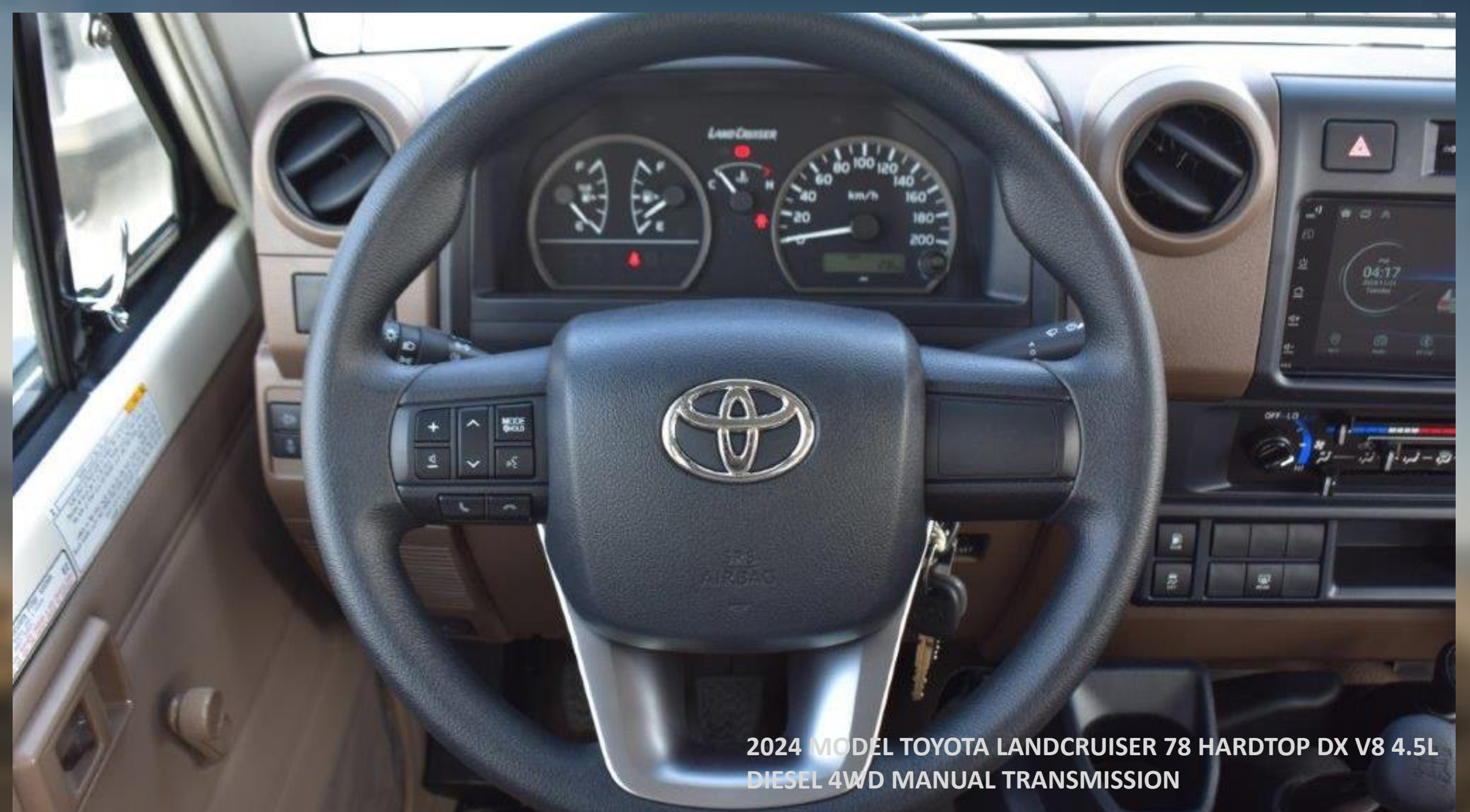
2024 MODEL TOYOTA LANDCRUISER 78 HARDTOP DX V8 4.5L DIESEL 4WD MANUAL TRANSMISSION